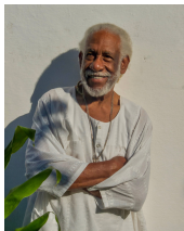
Manuel Mendive - Visual Artist