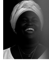
Daymé Arocena - Jazz singer